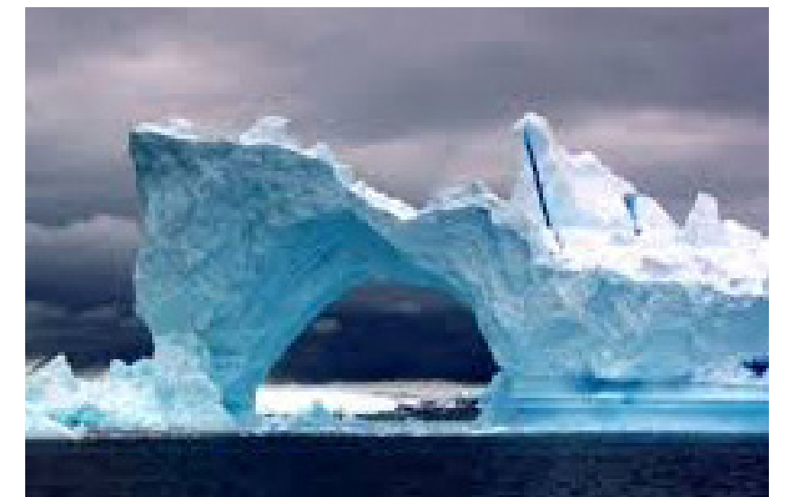
A still from “Antarctica 3D”