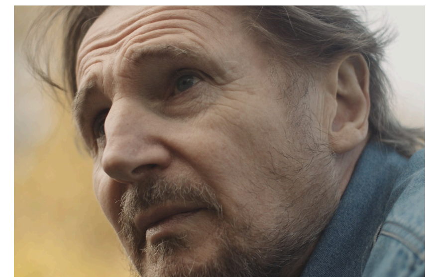
Liam Neeson in "Forever Protected"