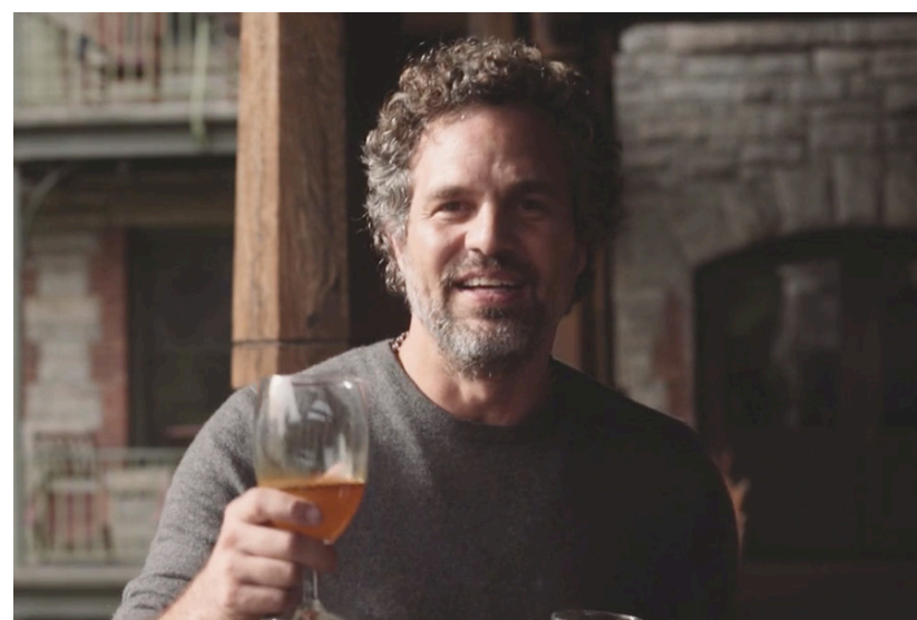
Mark Ruffalo in "Oil & Almonds"