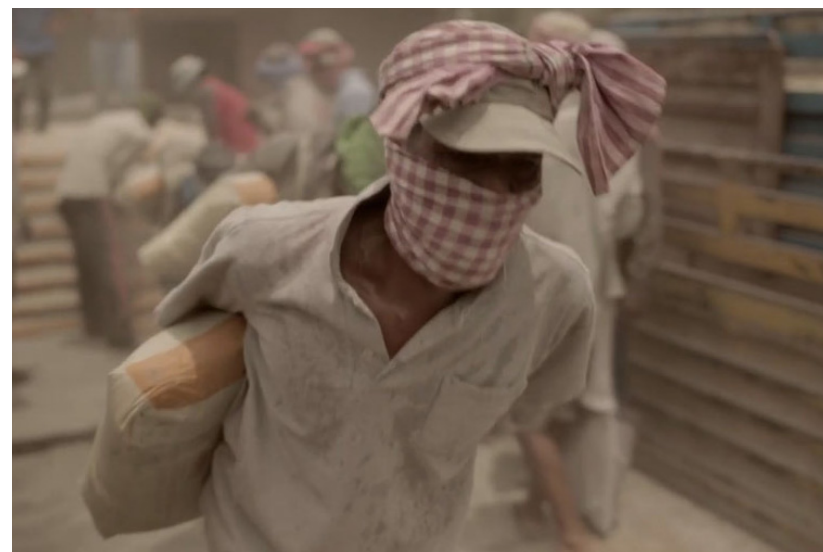
A still from “Ghost Fleet”