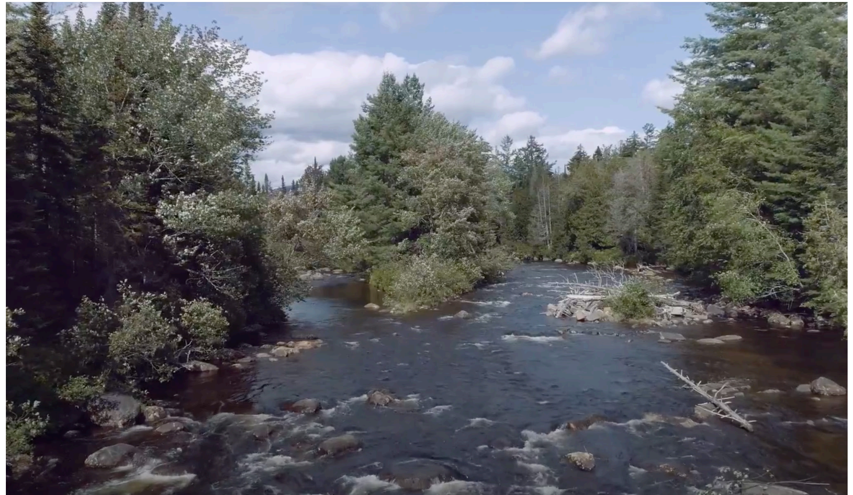
A still from "Source to Sea"